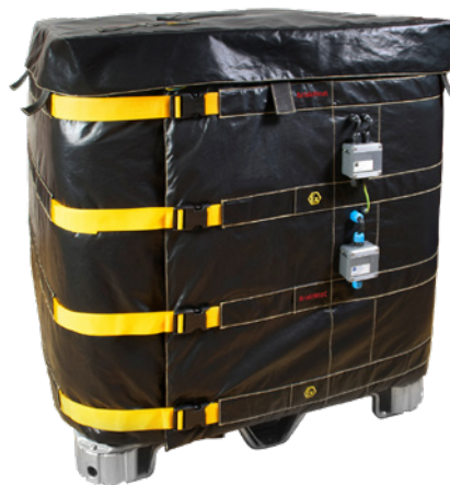
NEW ATEX Approved Wrap-Around Tote Tank/IBC Heaters page 5-22