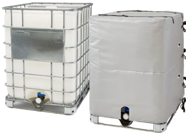
Original Wrap-Around Tote/Tank IBC Heaters page 5-17