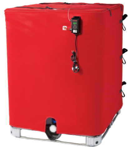
NEW Wet-Area Wrap-Around Tote Tank/ IBC Heaters and Insulators page 5-19