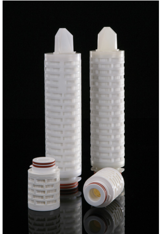
Note: TETPOR is a registered trademark of Parker Hannifin Corporation.