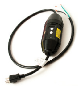
SLCBLUC-GF Ground Fault Power Connection Kit

SLCBLUC Universal Connection Kit (Junction Box sold separately)