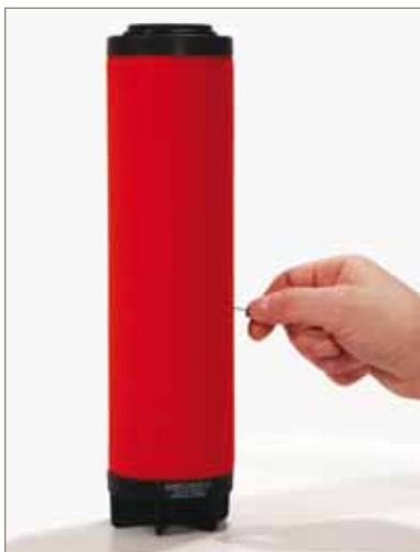
A pin point size hole here will rupture an elements media.

the green, the element does not require changing. Differential pressure gauges are neither filter service indicators nor air quality indicators; they simply measure differential pressure and offer an indication only of premature blockage.