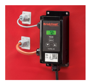
Easy-to-program digital controller