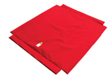
Optional Insulating Cover