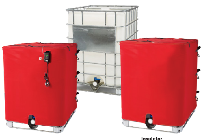
Heater (TOTEW series)