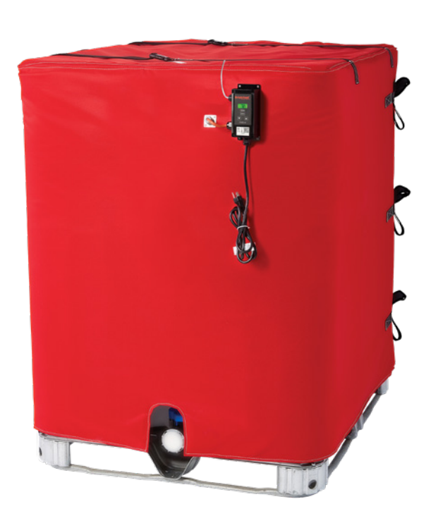
Heater — All-in-one, plug-and-play solution

Image above shown with optional top cover (sold separately)