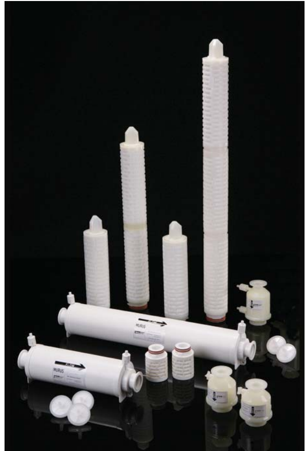
Note: PROCLEAR and DEMICAP are registered trademarks of Parker Hannifin Corporation.