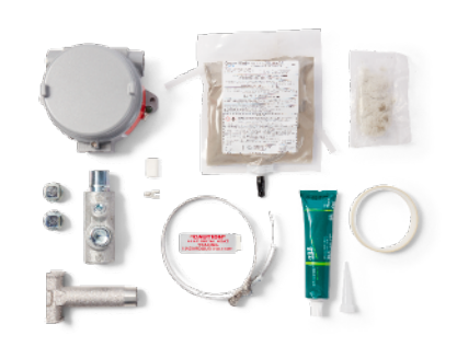
SLCABKC1 Class I, Division 1 End Termination Kit