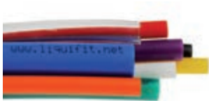
Advanced PE Tubing PU Tubing for lower temperatures