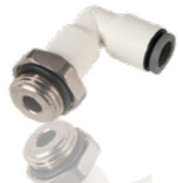
LIQUIfit® Push-In Fittings with Metal Adaptor