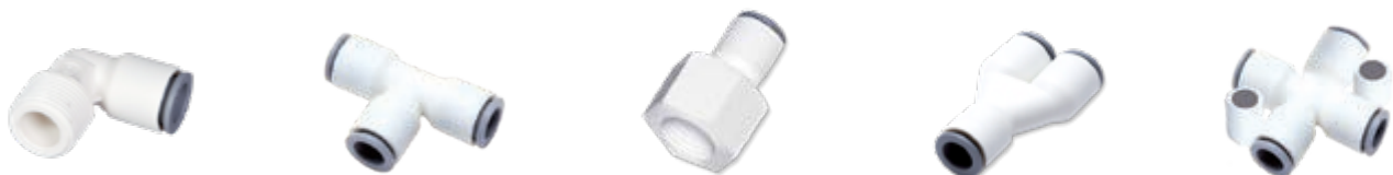
LIQUIfit® Tube-to-Tube Push-In Fittings