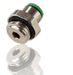
LIQUIfit® Male Straight Push-In Fittings with Metal Adaptor