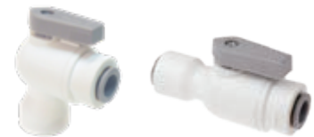
LIQUIfit® Ball Valves