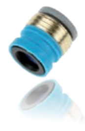
Carstick® cartridge EPDM seal