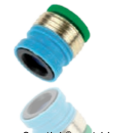
Carstick® cartridge FKM seal