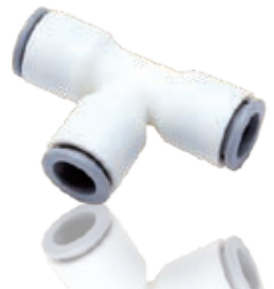
LIQUIfit® Tube-to-Tube Push-In Fittings