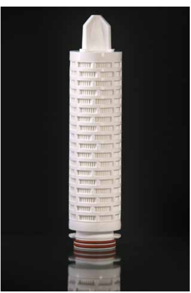
Note: PREPOR is a registered trademark of Parker domnick hunter