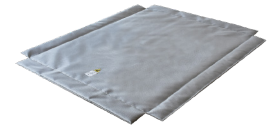
Optional Insulating Cover

Insulation thickness of top cover: 0.25 in (6 mm)