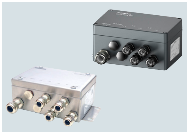
SIWAREX DB digital junction box in stainless steel and aluminum

SIWAREX DB is a digital junction box for enhanced diagnostics and monitoring options in conjunction with SIWAREX WP electronics.