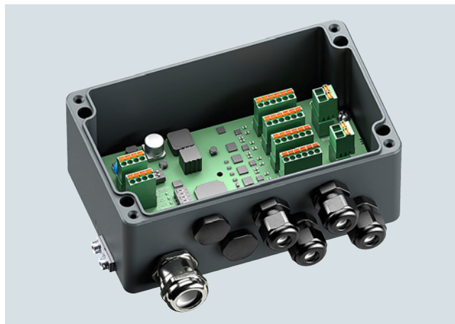
Internal view of SIWAREX DB

The SIWAREX DB is a digital junction box with a die-cast aluminum or stainless steel enclosure. The enclosure is dust-protected and splashproof according to IP66 degree of protection.