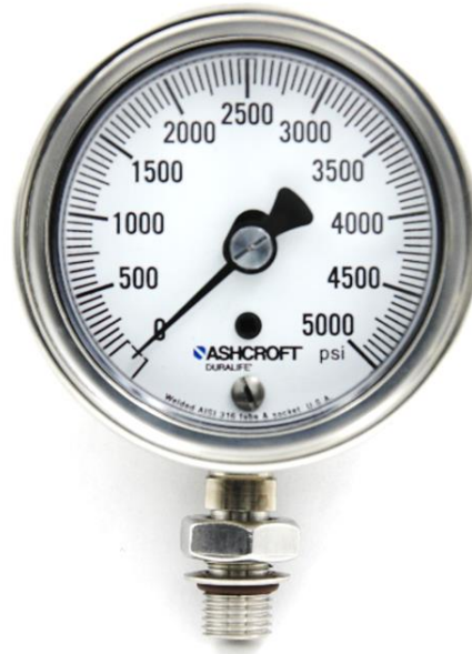
Figure 1 – 2 ½" Dial 1009 Pressure Gauge with SAE-4 7/16 -20 Straight Thread Process Connection (connection code "RW")

Applicable to: 25/35 1009SW and 1008S Pressure Gauges