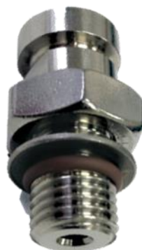
Figure 2 – SAE-4 7/16 -20 Straight Thread Process Connection