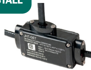
JHT-GET Low-Profile Tee Connection Kit