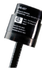
JHE-GET Low-Profile End Seal Kit